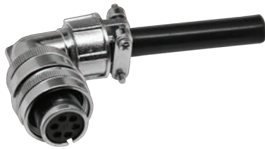
6-pin MS type

These installation instructions apply to all three 90° Connectors pictured below: