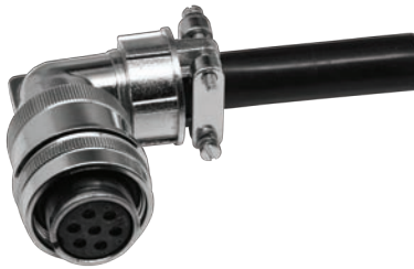
7-pin MS type