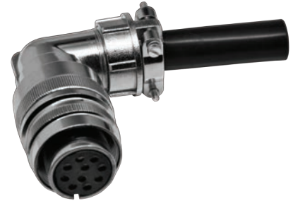
10-pin MS type