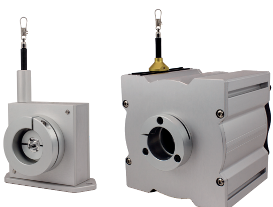
Model LCX draw wires

If you still have questions about output, or anything else encoder-related, contact EPC. When you call EPC, you talk to engineers and encoder experts who can answer your toughest encoder questions. Contact EPC today to get the information you need.